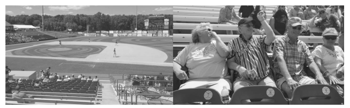
The Superior Seniors went to Appleton to see a Timberrattlers baseball game. A Great time was had by all.